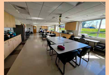
Central eating location