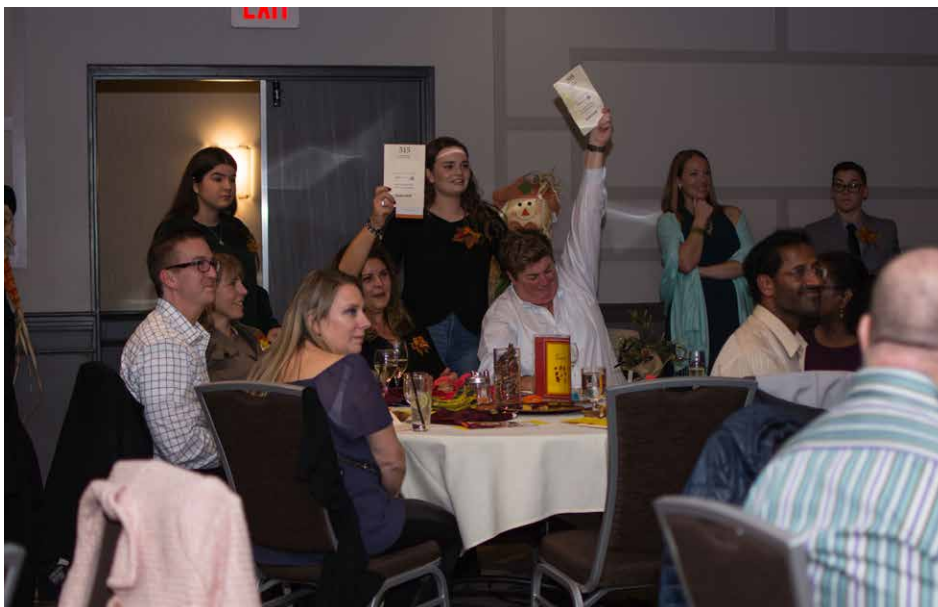
Guests bidding high during the Live Auction