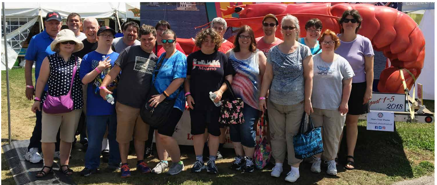
In July, the Rec-Connect program visited Maine and had a great time!