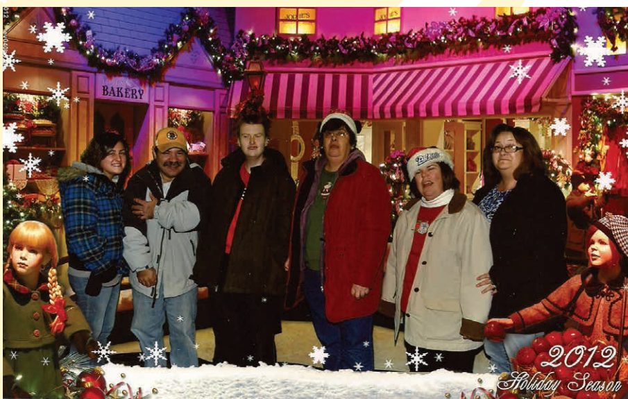
The Arc of Greater Fall River visited the Enchanted Village and LaSalette Shrine this season, and hosted a holiday party for the Fall River Resource Center.