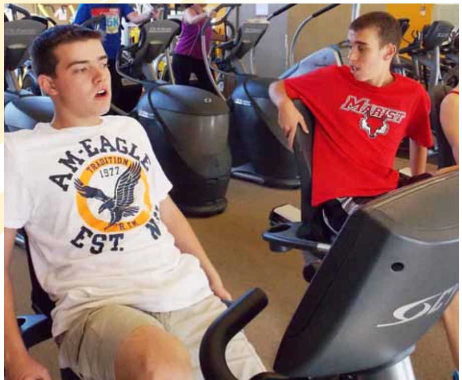
Thanks to a mini-grant from Stop & Shop and the Hockomock Area YMCA, youth from The Arc participated in a 4 week teen shape-up class.

Please register by November 1 to Sandy Boyer, (508) 226-1445 or (888) 343-3301 ext. 3123