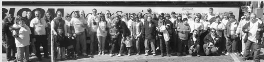
The Arc of Bristol County at All Aboard The Arc send-off.